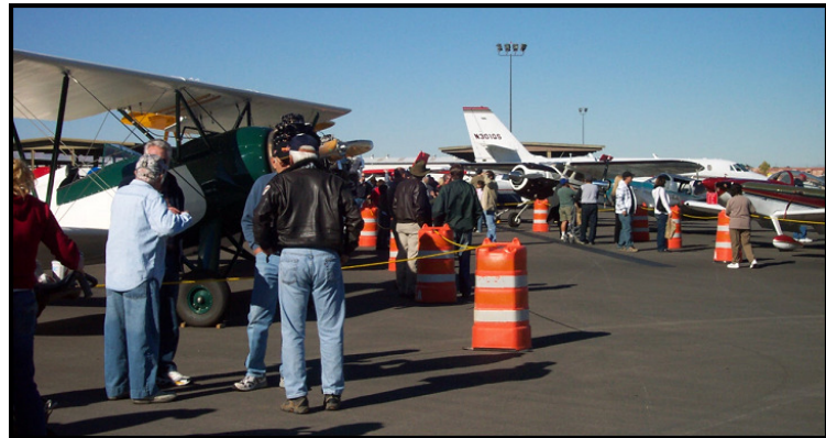
Local airplanes on display and pilots to talk to.

This is an on-going contest most right answers at the end of the year will receive a gift. Email your answers to Subject: LVV99s skysunlimited@gmail.com